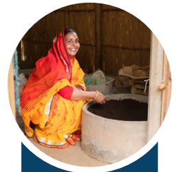
Environmentally Friendly Fertilizers