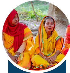
Strengthening Social Capital