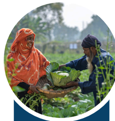
Climate Smart Agriculture Practice