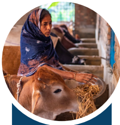
Climate Smart Livestock Farming