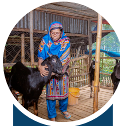
Perch System Goat Housing