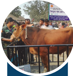
Digital Weighing Scale For Livestock