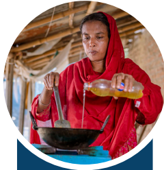
Biogas Produced From Cattle Waste