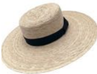
WOMENS BOATER WIDE BRIM $44

One size (22" or hat size 7). Approx. 5-5 1/2" brim with nylon chin strap w/plastic bead. Grosgrain sweatband. Hand-woven palm. UPF 50+