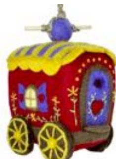
FELT GYPSY WAGON BIRDHOUSE $32

This hand-felted wool birdhouse is made of sustainably harvested, naturally water repellent wool. Made in Nepal.