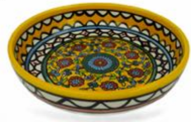
MEDIUM YELLOW DISH $28

Colorful ceramic bowl is intricately hand painted with bold floral patterns, a traditional Palestinian craft. High gloss glaze. Slight variations may occur due to handmade techniques. Food and microwave safe. Not oven safe. Hand wash. Made in the West Bank Small: 1 3/4" h x 6" dia. Medium: 2" h x 7" dia Large: 2in. h x 11in. dia.