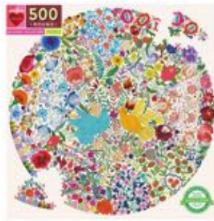
BLUE BIRD YELLOW BIRD 500 PIECE PUZZLE $18

This meticulously embroidered bouquet is so convincing it has attracted a few birds and butterflies. Made from 90% recycled gray board; printed with vegetable based inks.