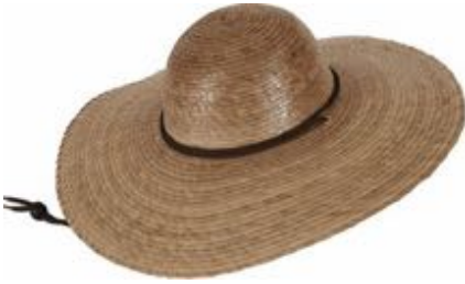
WOMENS BEACH HAT $36

One size (22" or hat size 7). Approx. 5-5 1/2" brim with nylon chin strap w/plastic bead. Grosgrain sweatband. Hand-woven palm. UPF 50+