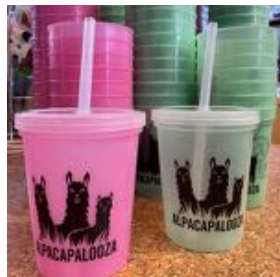
ALPACAPALOOZA COLOR CHANGING CUPS $2.50 EACH

100% polyester fabric, wipes clean. Two internal pockets and one external pocket.