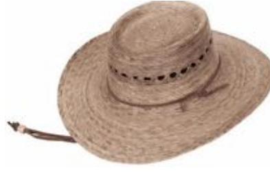
UNISEX OUTBACK LATTICE $35

At Tula Hats, you'll find our unisex straw gardening hat is attractive and practical for everyone! Although it was designed for men to wear, it looks great on women as well. Hand-woven and available in a simple style, this gardener sun hat will keep you cool in hot weather. Our hat comes with a UPF of 50+ which guarantees you'll be safe from the harsh UV rays of sunshine and it also has a stretch sweatband that adjusts to give you the right fit every time and a secure nylon strap with a spring-loaded ball lock to make sure it doesn't blow off on windy days. Hand-woven palm. Made in a small village in the mountains of Mexico,