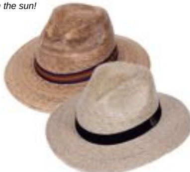
MEN'S EXPLORER BLACK OR MULTI COLORED BAND $34

Approx. 3 1/4" brim. Stretch sweatband. Hand-woven palm. UPF 50+