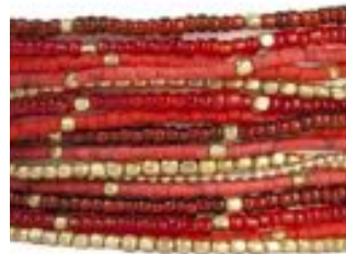
LAUREN CHERRY WRAP BRACELET $26

Semi-precious teardrop earrings in red, made from rough-cut glass and brass beads. Plated brass findings. Measurements: 1.5 inch drop, 1 inch wide. Made in Thailand and Vietnam