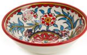
RED SERVING BOWL $38

Bamboo utensil set to round out the perfect toolkit for life on the go? A handy carabiner on the back lets you clip and carry a fork, knife, spoon, and chopsticks wherever they may roam. Perfect for a busy lifestyle and our precious planet. Case is made from 100% post-consumer recycled plastic bottles.