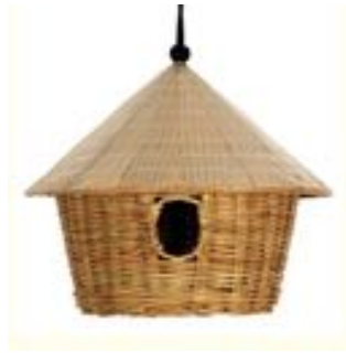
HAT ROOF BIRDHOUSE $18

This hand-felted wool birdhouse is made of sustainably harvested, naturally water repellent wool. Made in Nepal