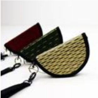
TACO SHAPED COIN PURSE $10

Made from elephant grasses that are dyed with natural dyes. Assorted colors available. Made in Cambodia.