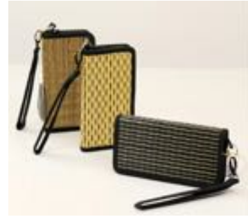
CELLPHONE WALLET CASE $18

Made from elephant grasses that are dyed with natural dyes. Assorted colors available. Made in Cambodia.