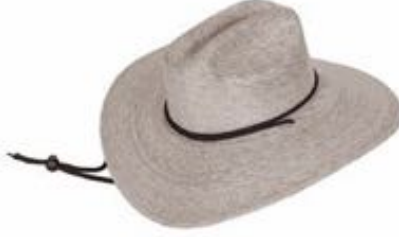
UNISEX/MENS LIFEGUARD $36

Approx. 4" brim. Stretch sweatband Hand-woven palm. UPF 50+