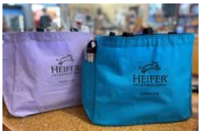
HEIFER TOTE $12 HYACINTH OR TURQUOISE

100% polyester fabric, wipes clean. Two internal pockets and one external pocket.