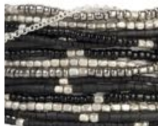
LAUREN MIDNIGHT WRAP BRACELET $26

Semi-precious teardrop earrings in gold and black, made from rough-cut glass and brass beads. Plated brass findings. Measurements: 1.5 inch drop, 1 inch wide. Made in Thailand and Vietnam