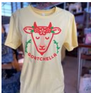
GOATCHELLA T-SHIRT $12

Handmade at Heifer Urban Farm, in Little Rock, Arkansas.