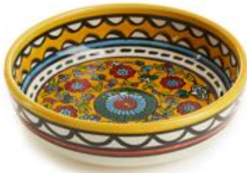
SMALL YELLOW DISH $22