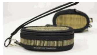
OVAL SHAPED COIN PURSE $10

Made from elephant grasses that are dyed with natural dyes. Assorted colors available. Made in Cambodia.