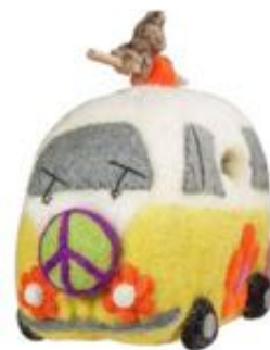
FELT MAGIC BUS BIRDHOUSE $32

This hand-felted wool birdhouse is made of sustainably harvested, naturally water repellent wool. Made in Nepal.