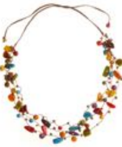
CONFETTI NECKLACE $30

Three natural, sustainable tagua nut beads are dyed in an array of cool tones, each element revealing its own unique shape and natural pattern. Colors may vary slightly. Sterling silver hooks. 2 1/4" made in Ecuador