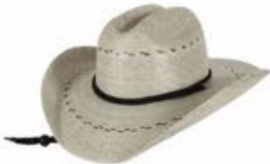
UNISEX DURANGO $36

Don't let the strong sun hinder your outdoor activities Handwoven in Mexico using a centuries-old tradition,