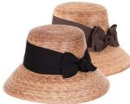
WOMEN'S SOMERSET $44

One size (22" or hat size 7). Approx. 3 1/2" brim. Grosgrain sweatband. Hand-woven palm. UPF 50+