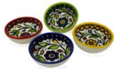
DIPPING BOWLS $8 EACH

Colorful ceramic bowl is intricately hand painted with bold floral patterns, a traditional Palestinian craft. High gloss glaze. Slight variations may occur due to handmade techniques. Food and microwave safe. Not oven safe. Hand wash. Made in the West Bank. Appetizer Plates: 1" h x 5 1/4" dia Red Platter: 1/2" h x 9" dia Dipping Bowls: 1 1/2" h x 3 1/2" dia.