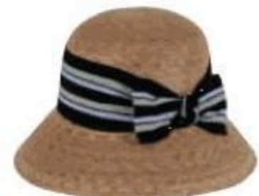
WOMEN'S ELLA MULTI- STRIPED BOW $44

Approx. 3 1/4" brim. Stretch sweatband. Hand-woven palm. UPF 50+