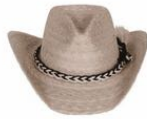
WESTERN DAKOTA LIGHT $36

This lifeguard straw hat is made of handwoven palm, so it doesn't get too hot on your head. The stretch sweatband woven into the hat holds with a snug fit without being too tight.