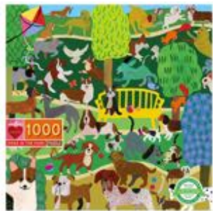
DOGS IN THE PARK 1000 PIECE PUZZLE $20

The simple pleasure of nurturing seeds into a lush garden can bring about a perfect level of calm in the cacophony of the city. Made from 90% recycled gray board; printed with vegetable based inks.