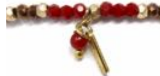
ERIN CRANBERRY KNOT BRACELET $10

Measurements: 19 inches end to end, adjustable 5 inches cording. Materials: Beads, brass, and vegan leather. from Thailand and Vietnam