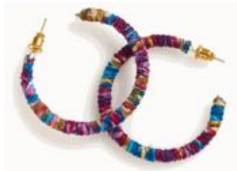
WARM SARI HOOP EARRINGS $12

This repurposed textile bracelet comes with a Hope attribute tag, which reads "Hope reminds us of our limitless potential for the future. This Hope Bracelet brings new possibilities to women artisans in India."