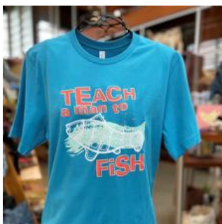
TEACH A MAN TO FISH T-SHIRT $17

52% Cotton, 48% polyester, Bella Canvas. Available sizes: M, L, XL & XXL.