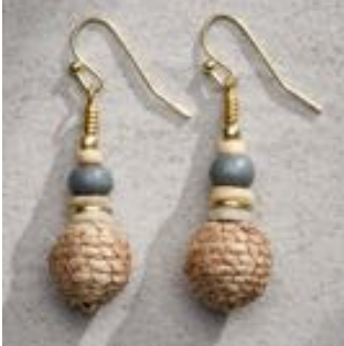
KINARA EARRINGS $18

Light wooden beads complement handmade grey palewa stone and jute-wrapped round beads, accented by small shell discs and multi-faceted brass beads. Brass hooks. 1 3/4" Made in India