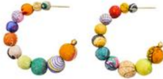
KANTHA MINI HOOP EARRINGS $15

Measures 4 ½" long; with nickel-free, lead-free French ear wires. Colors and patterns will vary due to the repurposed cotton Kantha fabric.