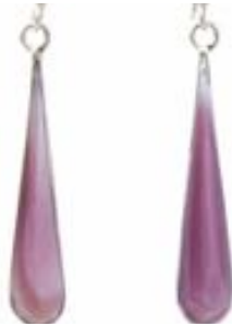
MULBERRY CLAM SHELL ELONGATED TEARDROP $14

These wide tear-drop shaped earrings are 1.5" long by .75" wide with alpaca silver hooks. Handcrafted in Mexico.