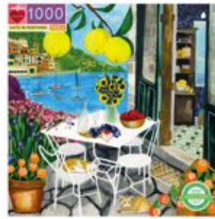
CATS IN POSITANO 1000 PIECE PUZZLE $20

The Tree of Life is inspired by a medieval tapestry. Illustrated by Jennifer Orkin Lewis. Made from 90% recycled gray board; printed with vegetable based inks.