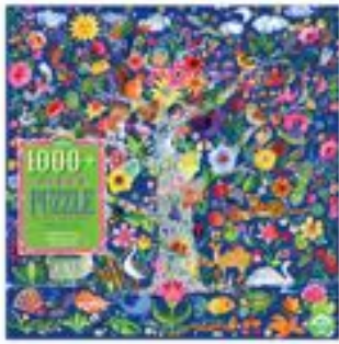
TREE OF LIFE 1000 PIECE PUZZLE $20

A celebration of sisterhood and the magic of the natural world is captured in the artwork of Uta Krogmann (@MiraParadies). Made from 90% recycled gray board; printed with vegetable based inks.