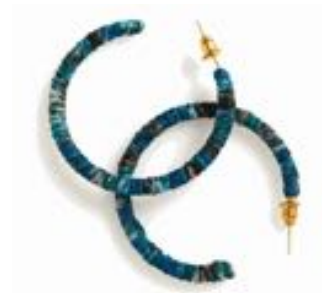
COOL SARI HOOP EARRINGS $12

Three beads with a matching tassel fall gracefully from french hook ear wires. 3" Made in Guatemala.