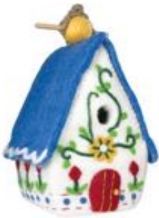
FELT HEIDI CHALET BIRDHOUSE $32

This hand-felted wool birdhouse is made of sustainably harvested, naturally water repellent wool. Made in Nepal