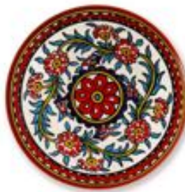
RED PLATTER $24