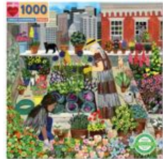
URBAN GARDEN 1000 PIECE PUZZLE $20

Relax with these lounging cats on the Amalfi Coast. Made from 90% recycled gray board; printed with vegetable based inks.