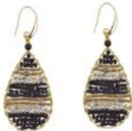
LAUREN MIDNIGHT EARRINGS#15

Measures 6" end to end, adjustable 2.5" cording. Handcrafted in Thailand from semi-precious stone, brass, crystal, and vegan leather.