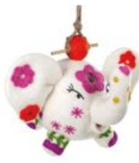
FELT FLOWER POWER PATTY BIRDHOUSE $32

This hand-felted wool birdhouse is made of sustainably harvested, naturally water repellent wool. Made in Nepal.