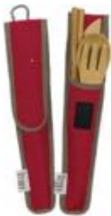
REPEAT WARE CAYENNE $12

Colorful ceramic bowl is intricately hand painted with bold floral patterns, a traditional Palestinian craft. High gloss glaze. Slight variations may occur due to handmade techniques. Food and microwave safe. Not oven safe. Hand wash. Made in the West Bank. Appetizer Plates: 1" h x 5 1/4" dia Red Platter: 1/2" h x 9" dia Dipping Bowls: 1 1/2" h x 3 1/2" dia.