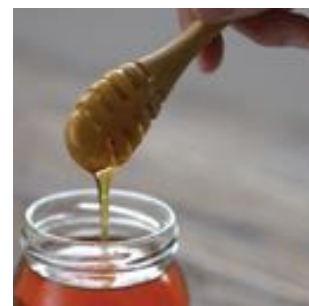
HONEY DIPPER $5

Colorful ceramic bowl is intricately hand painted with bold floral patterns, a traditional Palestinian craft. High gloss glaze. Slight variations may occur due to handmade techniques. Food and microwave safe. Not oven safe. Hand wash. Made in the West Bank. 2 3/4" h x 8 1/2" dia