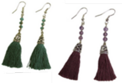
TASSEL & BEAD EARRINGS $6 PURPLE OR GREEN

Metallic cut gold discs and Kantha wrapped beads alternate to form this chic, colorful style. Measures ¼" wide; stretches to fit most wrists. Colors and patterns will vary due to the repurposed fabric