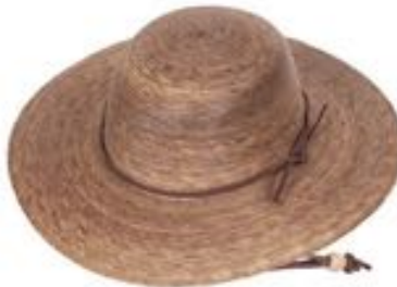
CHILDREN'S RANCH $22