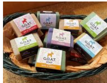
GOAT MILK SOAPS $3.50 EACH

Each cup comes with a lid and straw. Pink turns to purple and green turns to blue when cold liquid is poured in.