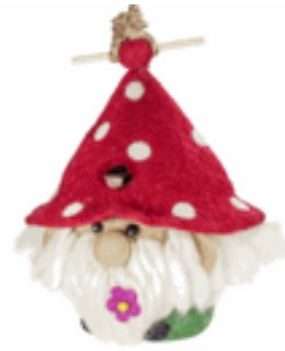
FELT GARDEN GNOME $32

Hat roof removes for easy cleaning. Made in Cambodia