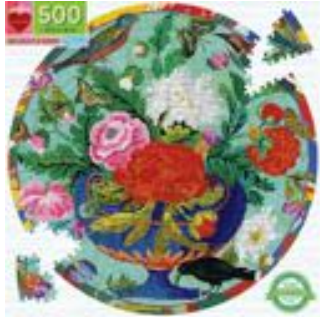
BOUQUET & BIRDS 500 PIECE PUZZLE $18

This meticulously embroidered bouquet is so convincing it has attracted a few birds and butterflies. Made from 90% recycled gray board; printed with vegetable based inks.