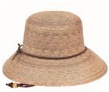
CHILDREN'S ABBY $22