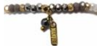
ERIN THUNDERSTORM KNOT BRACELET $10

Measurements: 19 inches end to end, adjustable 5 inches cording. Materials: Beads, brass, and vegan leather. from Thailand and Vietnam