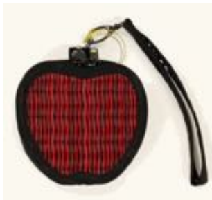
APPLE SHAPED COIN PURSE $12

Made from elephant grasses that are dyed with natural dyes. Assorted colors available. Made in Cambodia.