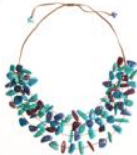
TAGUA COOL PEBBLE NECKLACE $32

Handcrafted silver-plated oval earrings with handmade turquoise. Earring drop is 1.5". Sterling silver loops. Made in Mexico.