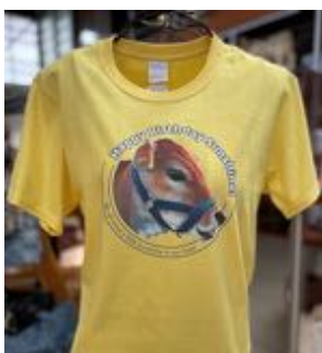
HAPPY BIRTHDAY SUNSHINE T-SHIRT $10

Youth Sizes: 2T through Large. 100% cotton.