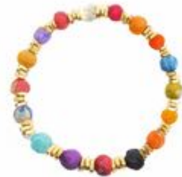
METALBLOCK KANTHA BRACELET $12

Recycled cotton saris, fabric colors and patterns will vary. Brass hooks. 1 1/2"h x 1 1/2"w