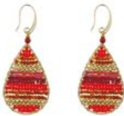
LAUREN CHERRY EARRINGS $15

Handcrafted wide hoop earrings in multi-colored resin. Hypoallergenic post. 1.75 inch width. Drop is 2 inches. Due to the organic nature of acetate/resin, the marbleization of each piece will vary.