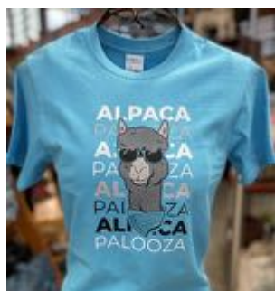
ALPACAPALOOZA BLUE T-SHIRT $12

100% cotton, Bella Canvas. Available sizes: M, L, XL & XXL