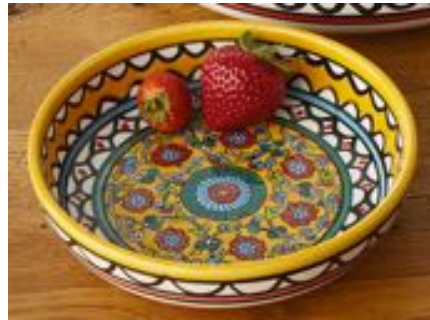
LARGE YELLOW DISH $46