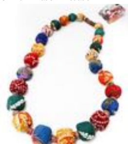
SILK NECKLACE $20

Colorful cluster earrings made from dyed acai and tagua seeds on knotted nylon cords. Brass-colored seed bead accents. Sterling silver hooks. 2 1/8" Made in Ecuador