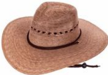
UNISEX GARDENER LATTICE $35

These country western hats have a 3" front brim, 3 1/2" side brim, providing plenty of shade for your face. UPF50+ sun protection rating. The stretch sweatband along the inside will keep your head cool, too.