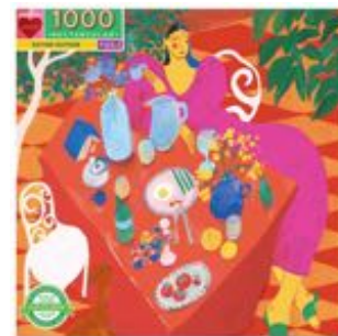
EATING OUTSIDE 1000 PIECE PUZZLE $20

Puzzle your way through eeBoo's Dog Park 1000 Piece Puzzle, illustrated by Monika Forsberg (@monika_forsberg). Made from 90% recycled gray board; printed with vegetable based inks.