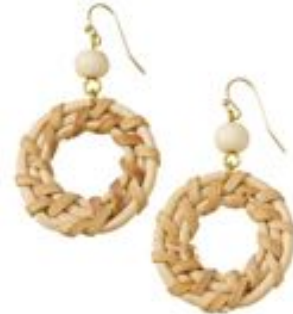
AMARA EARRINGS $18

Light wooden beads complement handmade grey palewa stone and jute-wrapped round beads, accented by small shell discs and multi-faceted brass beads. Necklace is adjustable up to 25". Lobster clasp. Made in India