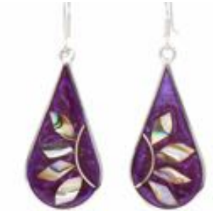
DEEP PURPLE WITH ABALONE PETALS $12

These wide tear-drop shaped earrings are 1.5" long by .75" wide with alpaca silver hooks. Handcrafted in Mexico.