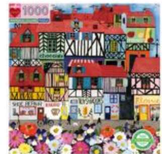
WHIMSICAL VILLAGE 1000 PIECE PUZZLE $20

A fiery palette of reds oranges and purples offers a challenge to the discerning puzzler in Ana Leovy's painting of a mysterious woman reclining for an al fresco lunch. Made from 90% recycled gray board; printed with vegetable based inks.