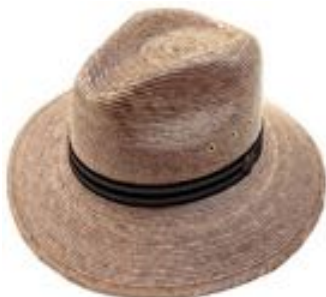
UNISEX/MEN'S CLARK $40

One size (22" or hat size 7). Approx. 3 1/2" brim. Grosgrain sweatband. Hand-woven palm. UPF 50+