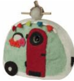
FELT RETRO CAMPER BIRDHOUSE $32

This hand-felted wool birdhouse is made of sustainably harvested, naturally water repellent wool. Made in Nepal