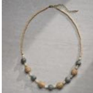
KINARA NECKLACE $20

Light wooden beads complement handmade grey palewa stone and jute-wrapped round beads, accented by small shell discs and multi-faceted brass beads. Brass hooks. 1 3/4" Made in India