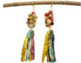
KANTHA CLUSTER FRINGE EARRINGS $16

Colors and patterns will vary due to the repurposed cotton Kantha fabric.