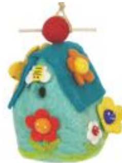
FELT FLOWER HOUSE BIRDHOUSE $32

This hand-felted wool birdhouse is made of sustainably harvested, naturally water repellent wool. Made in Nepal