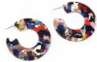
MULTI-COLORED RESIN HOOP EARRINGS $32

Measures 1.25" long by .25" wide with alpaca silver hooks. Handcrafted in Mexico.