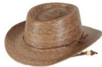
CHILDREN'S OUTBACK $22

Handcrafted from 100 percent natural palm fiber using a centuries-old technique, our kids' straw hats are one of a kind and will be cherished over the years. They've also been awarded the highest degree of sun protection – UPF 50+ – by the California Polytechnic Textile Research and Testing Laboratory, so you can rest assured they'll keep the sun at bay.