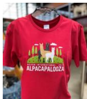
ALPACAPALOOZA RED T-SHIRT $10

Youth Sizes: 2T through Extra Large 100% cotton.