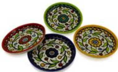
APPETIZER PLATES $8 EACH

Colorful ceramic bowl is intricately hand painted with bold floral patterns, a traditional Palestinian craft. High gloss glaze. Slight variations may occur due to handmade techniques. Food and microwave safe. Not oven safe. Hand wash. Made in the West Bank Small: 1 3/4" h x 6" dia. Medium: 2" h x 7" dia Large: 2in. h x 11in. dia.