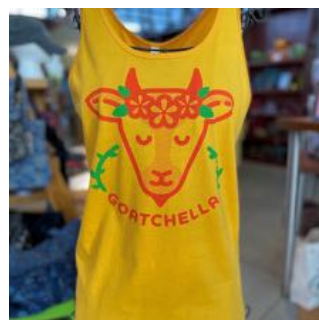
GOATCHELLA TANK TOP $15

100% cotton, Bella Canvas. Available sizes: XS, S, M, L, XL, XXL, XXXL & XXXXL