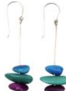
ROCA EARRINGS $22

Tagua seeds are dyed in jewel-tone colors, each element revealing its own unique shape and natural pattern. Colors may vary slightly. Waxed fiber cords are adjustable to size as you like. Layered four-strand necklace. adjusts to 27". Made in Ecuador