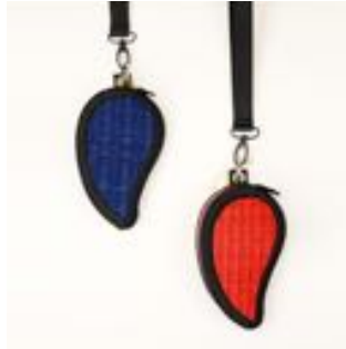
MANGO SHAPED COIN PURSE #10

Made from elephant grasses that are dyed with natural dyes. Assorted colors available. Made in Cambodia.