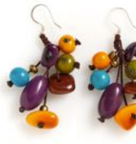
CONFETTI EARRINGS $22

Tagua seeds are dyed in jewel-tone colors, each element revealing its own unique shape and natural pattern. Colors may vary slightly. Waxed fiber cords are adjustable to size as you like. Layered four-strand necklace. adjusts to 27". Made in Ecuador