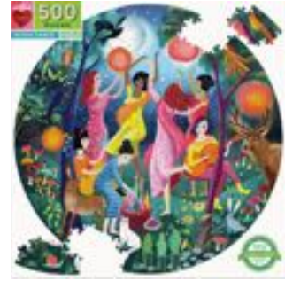
MOON DANCE 500 PIECE PUZZLE $18

This intricate collage of embroideries from around the world will transport any puzzler into focused calm. Made from 90% recycled gray board; printed with vegetable based inks.