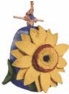
FELT SUNFLOWER BIRDHOUSE $32

This hand-felted wool birdhouse is made of sustainably harvested, naturally water repellent wool. Made in Nepal