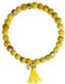
KANTHA CONNECTION BRACELET YELLOW HOPE $12

Measures 4" long; with French earring wires. Colors and patterns will vary.