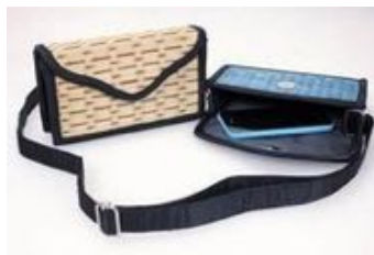
DOLLAR BILL PURSE $17

Made from elephant grasses that are dyed with natural dyes. Assorted colors available. Made in Cambodia.