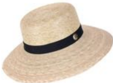
WOMEN'S ROCKPORT BLACK BAND $36

Handcrafted from 100 percent natural palm fiber using a centuries-old technique, our kids' straw hats are one of a kind and will be cherished over the years. They've also been awarded the highest degree of sun protection – UPF 50+ – by the California Polytechnic Textile Research and Testing Laboratory, so you can rest assured they'll keep the sun at bay.