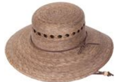
WOMEN'S ROCKPORT LATTICE $36

No matter if you want to garden, travel, relax by the beach or simply have a stylish hat to wear outside, our sun hat with bow is the perfect accessory to protect you from the sun!