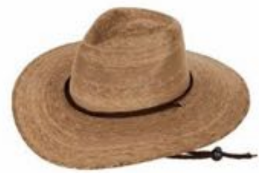
UNISEX GARDENER SOLID $36