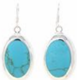
TAXCO TURQUOISE OVAL ALPACA SILVER EARRINGS $21

Artisans weave dried cane to craft these beautiful, lightweight earrings. Accented with hand-carved bone beads. Brass hooks. 2 1/4" Made in India