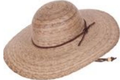
WOMEN'S ELEGANT RANCHER $35

Approx. 4 1/2" - 5" brim. Elasticized inner sweatband Hand-woven palm. UPF 50+