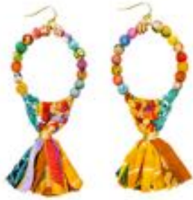
KYLA STATEMENT EARRINGS $22

Measures 4 ½" long; with nickel-free, lead-free French ear wires. Colors and patterns will vary due to the repurposed cotton Kantha fabric.