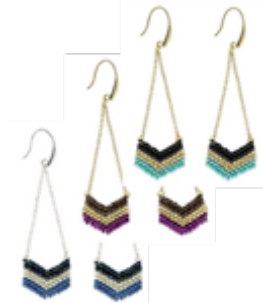
EVE EARRINGS $18

Recycled cotton saris, fabric colors and patterns will vary. Brass hooks. 1 1/2"h x 1 1/2"w