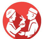
Passing on the Gift

At some time, everyone needs a helping hand. Your participation in Heifer projects supports a positive change by helping others as you have been helped. Heifer farmers and their families enjoy improved nutrition and income. They receive joy by Passing on the Gift® to their neighbors.